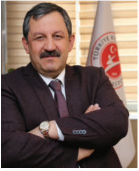
Dear WAKO Family,

Dear friends, the 8th Turkish Open WAKO World Cup, which has become a tradition will be organised for the 8th time, will be held in Istanbul between 18-21 May 2023 this year. The World Cup we held in 10 Rings and 14 Tatamis in 2022 became one of the biggest Kickboxing organizations in the world. I believe that there will be more participation this year in the "Turkish Open WAKO World Cup", which attracts an increasing interest day by day. This WORLD CUP has a special importance, there was an earthquake that affected about 10 provinces in the southeast of our country recently. After this disaster that caused deep pain in our country, we will heal our wounds through sports. The Turkish Open WAKO World Cup has a special importance for us in 2023 for this reason.