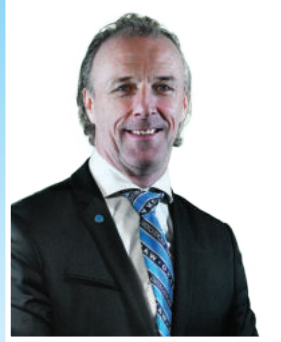
Dear WAKO Members,