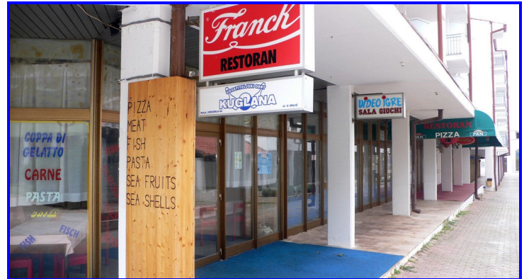
Hotel complex "Punta Verudela"