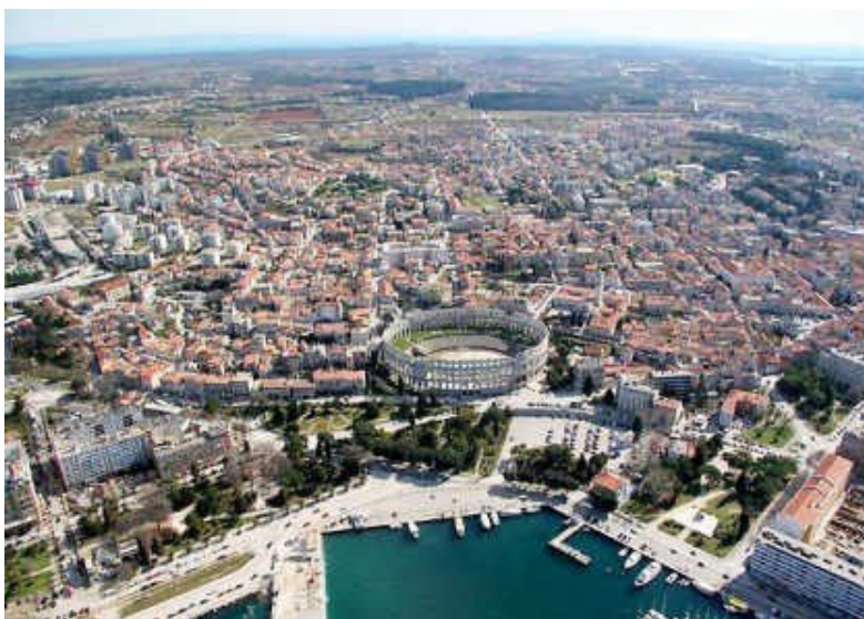
City of Pula

Airport - Bus station → 6,6 km Bus station - Hotel → 6,3 km Hotel - Sports hall → 2,9 km